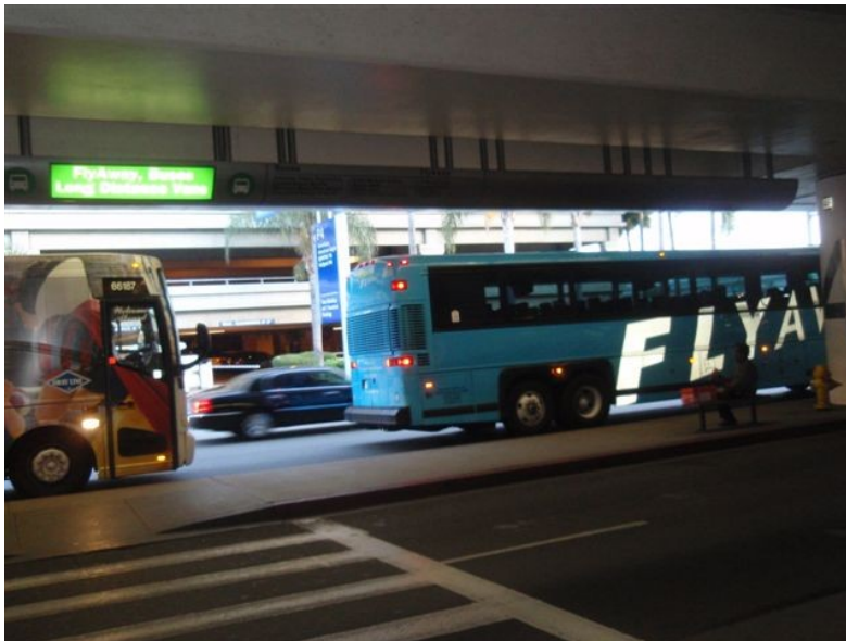
Figure 2 Flyaway bus departing from LAX stop

Take Flyaway bus at LAX to Union Station (be careful not to take Flyaway bus to other destinations, there are at least two other Flyaway destinations). Bus comes every 30 minutes. Pay $7 cash when you get off (no credit cards or checks)